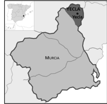
There are 15,074 acres of vineyard land in Yecla.

What makes Bellum unique? 1) Among the 840 acres owned by the Candela family, Bellum wines are made from the 14 finest acres of vineyard land. 2) Low yielding old Monastrell vines, 3) The grapes of each parcel are vinified separately to keep the personality of each wine clearly distinct.