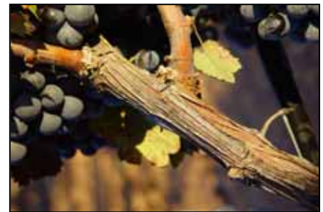
Monastrell is the second most important Spanish red grape after Garnacha.