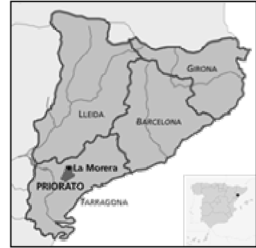
There are 4,077 acres of vineyard land in Priorat.

What makes Cesca unique? 1) Small production wines from estate owned family vineyards since the 13th century and possibly the oldest vineyards in the region. 2) Cesca’s pioneering efforts in participating in the “first-wave” of the revolutionary changes that Priorat has undergone in the last 10 years. 3) Wines produced are driven by structural balance and a distinct elegant quality in contrast, some Priorat wines exhibiting high alcohol, not well integrated into the wine—hot on the palate and finish.