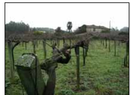
High standing trellises to maximize aeration providing a drier environment for grape ripening.