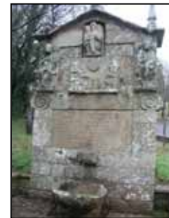
16 th century fountain that pours Albariño wine for the pilgrims of el Camino de Santiago to the date.