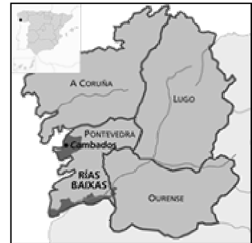
There are 6,981 acres of vineyard land in Rias Baixas.

What makes Pazo Galego unique? 1) Fermented with the natural yeast of its own grapes. 2) Pazo Galego is a distinct Albariño revealing the virtues of its unique terroir. 3) Low yielding vines fashioning expressive / concentrated grapes. 4) Pazo Galego undergoes only partial-malolactic fermentation to achieve greater freshness and aromatic expression.