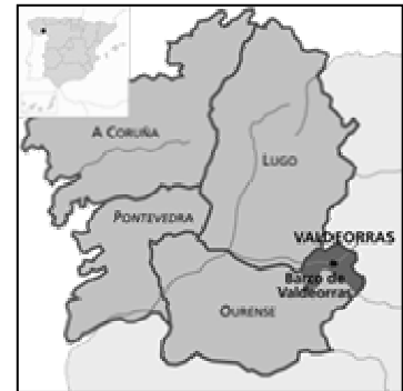
There are 3,296 acres of vineyard land in Valdeorras.