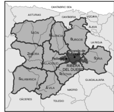
There are 45,876 acres of vineyard land in Ribera del Duero.