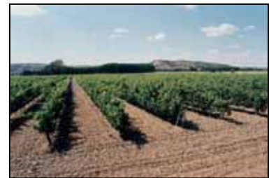
Tempranillo vines protected by the north hill of Quintana.