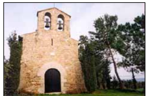
13 th Century shrine within the vineyards of Naverán.

Macabeu: (syn. Viura) late budding, pale skinned grape and both grows well in hot climates and matures without oxidizing, nose of floral aromas with low acidity.