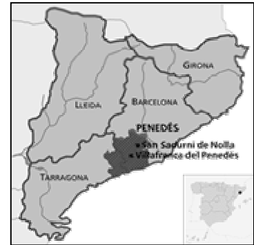
There are 68,521 acres of vineyard land in Penedés.

What makes Naverán wines unique? 1) Consistency in producing superior quality sparkling wines. 2) Entirely estate own vineyards allowing for higher quality control. 3) Old vines resulting in smaller yields, increasing concentration and grape quality. 4) 85% of the Cavas made by Naverán are sold in France--the mother country of Champagne!