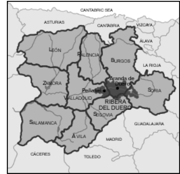
There are 45,876 acres of vineyard land in Ribera del Duero.