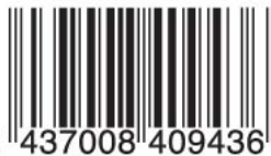
Image Type: Back

Actual Dimensions: 3.75 inches W X 3.75 inches H